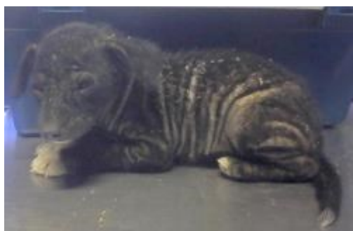
Angel on arrival