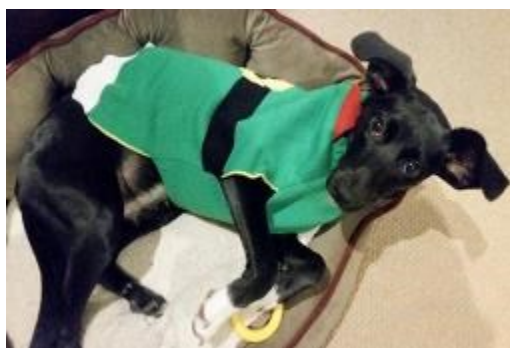
All wrapped up!