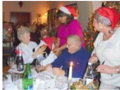
Does it bark a lot?