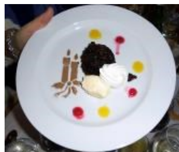
Yum Yum Christmas pud Le Marquis style

All in all, a fantastic afternoon which raised a total of €825 for Goldra!! And we have already had six repeat bookings for next year's Christmas lunch.