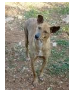
Cindy is their Mum

Donations for food and vet bills urgently needed