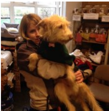
Bigger than she looks!