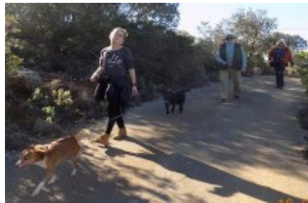
Follow my leader.

This regular event is a vital part of the work, as it helps to socialise the dogs in preparation for rehoming. It is also, of course, a social occasion for both four and two legged members of the Goldra community, hugely enjoyed by all concerned.