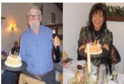
Happy Birthday to Two!