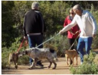
Who is walking whom?

16th January saw the latest mass walk from the sanctuary, as over thirty dogs were given much needed exercise by enthusiastic volunteer lead-holders.