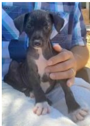
Looking more lively!